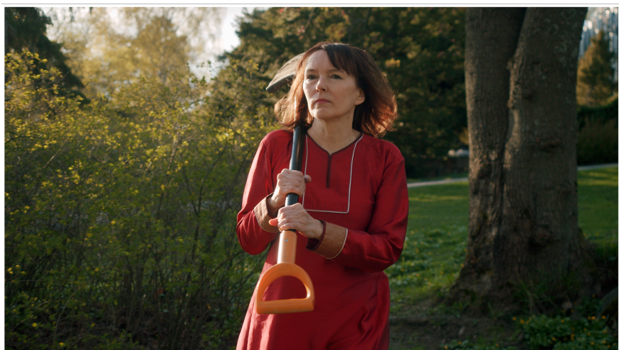
HOME SWEET HOME - SIGNIFICANT DIGITAL PREMIERE OF SÁMI FILMS

A positive measure enabled through The International Sámi Film Institute was the invitation to Saami film makers to apply for small grant to make short film about the COVID-19 situation. All together 15 short films will show experiences of the lockdown and the Covid-19 situation from a Saami perspective. The series is called Home Sweet home - Oru lea buoret gojodí (A Saami saying). The films became available in June[3]. https://www.isfi.no/en/?post=home-sweet-home-significant-digital-premiere-of-sami-films